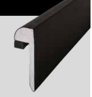
Length Dimensions 2.5m (L) x 100mm (D)